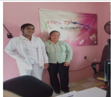
NHI registration Campaign on Romantica FM