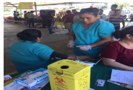
Dangriga Polyclinic taking part in World Diabetics Day -Belmopan UB