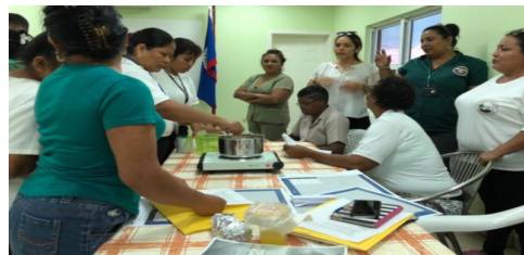
Dangriga Polyclinic Nutritionist training Independence Rural Health Nurse and Community Health Workers