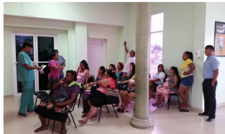
Dentist giving health talk