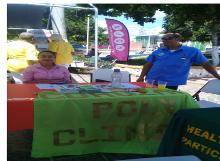
NHI Registration campaign